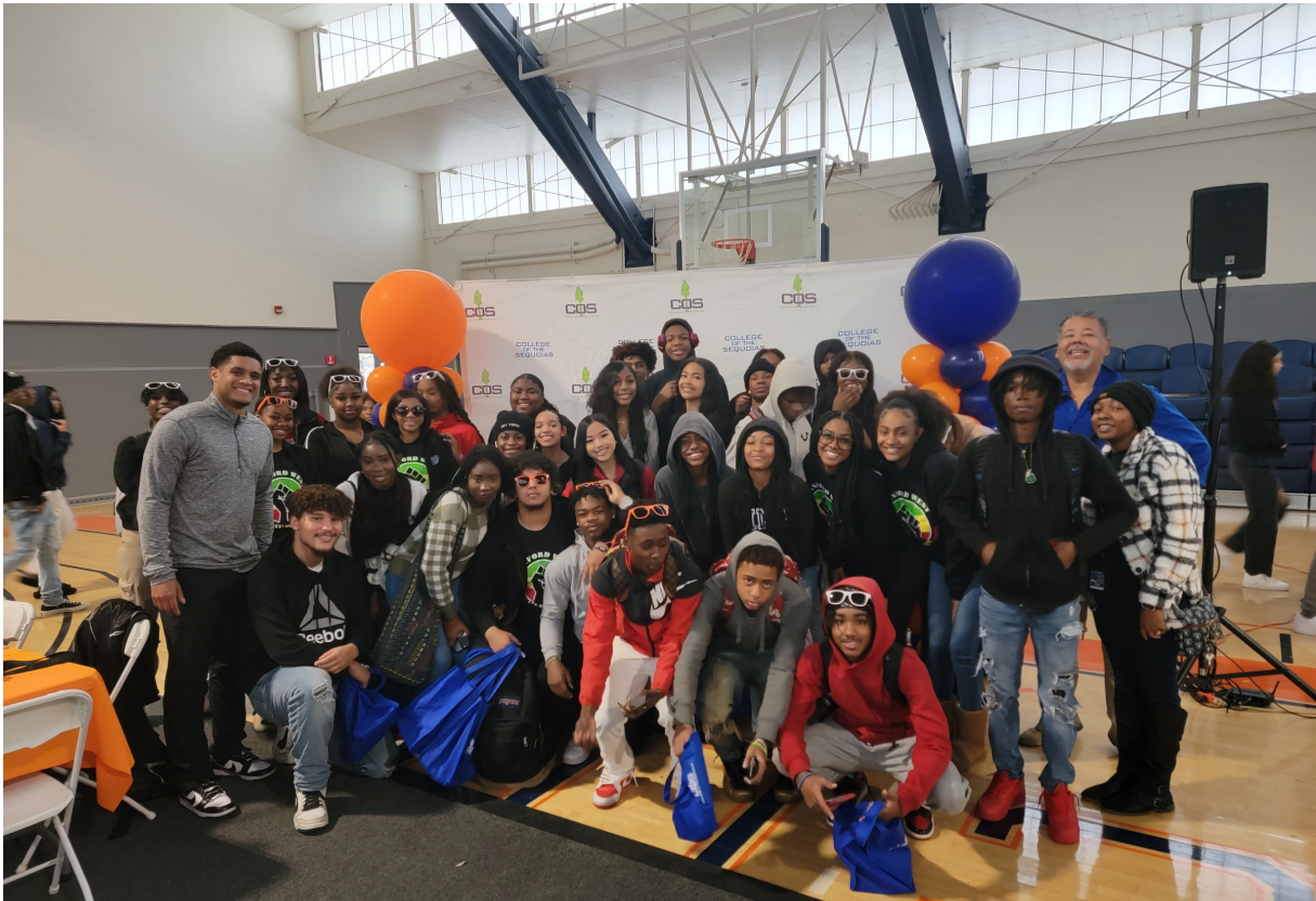
Hanford West Students attend College of the Sequoias "HBCU Pathways Program, Leadership Conference".